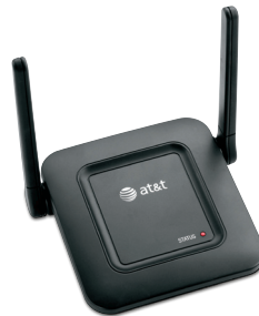
SB67128 Accessory Repeater