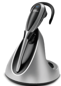
TL7600 Cordless Headset