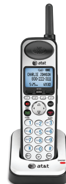
SB67108 Cordless Handset